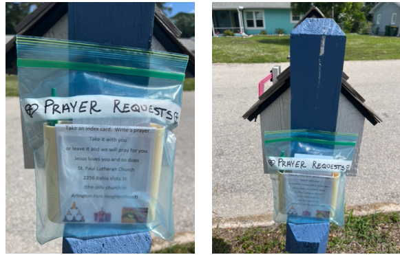
Prayer request station outside PrAshley's house.