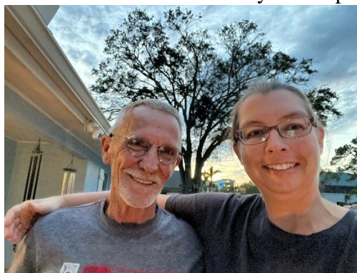
The two of us before he left for Kentucky