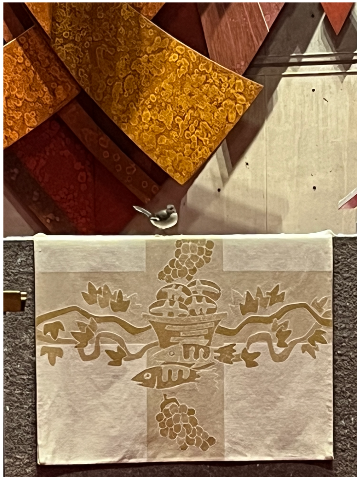
December 31, 2023 this little birdie flew into the Sanctuary and alighted on the altar.